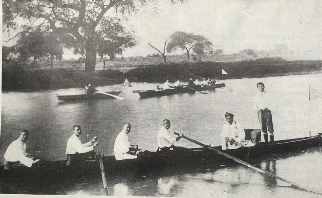
The boat carrying Lokmanya Tilak belongs to The Boat Club of COEP Tech.