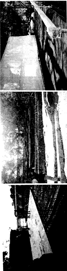
Main stage (Block A)

*Enclosed are the photographs of previous years infrastructure, Bidder needs to consider this as the guideline for the work proposed.