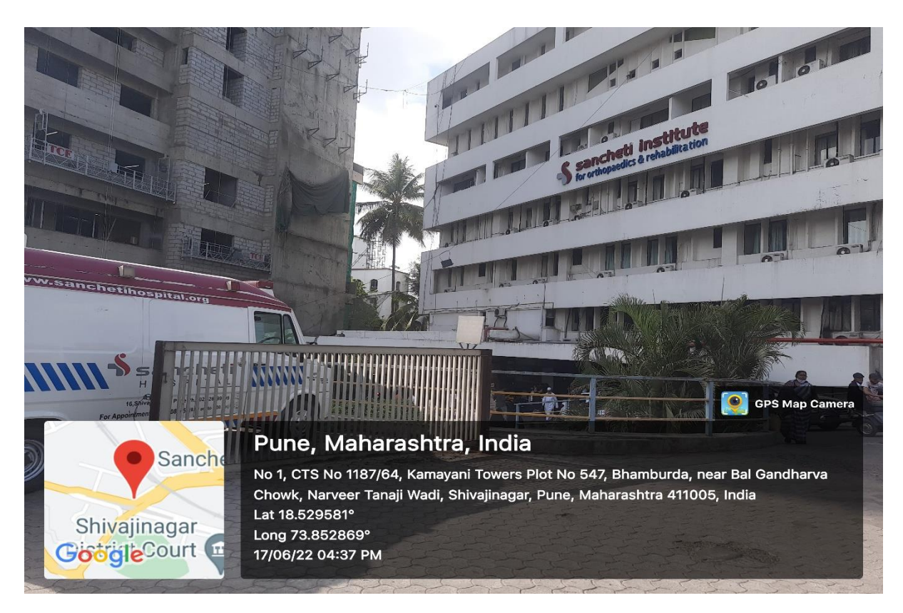
Sancheti Hospital near college campus